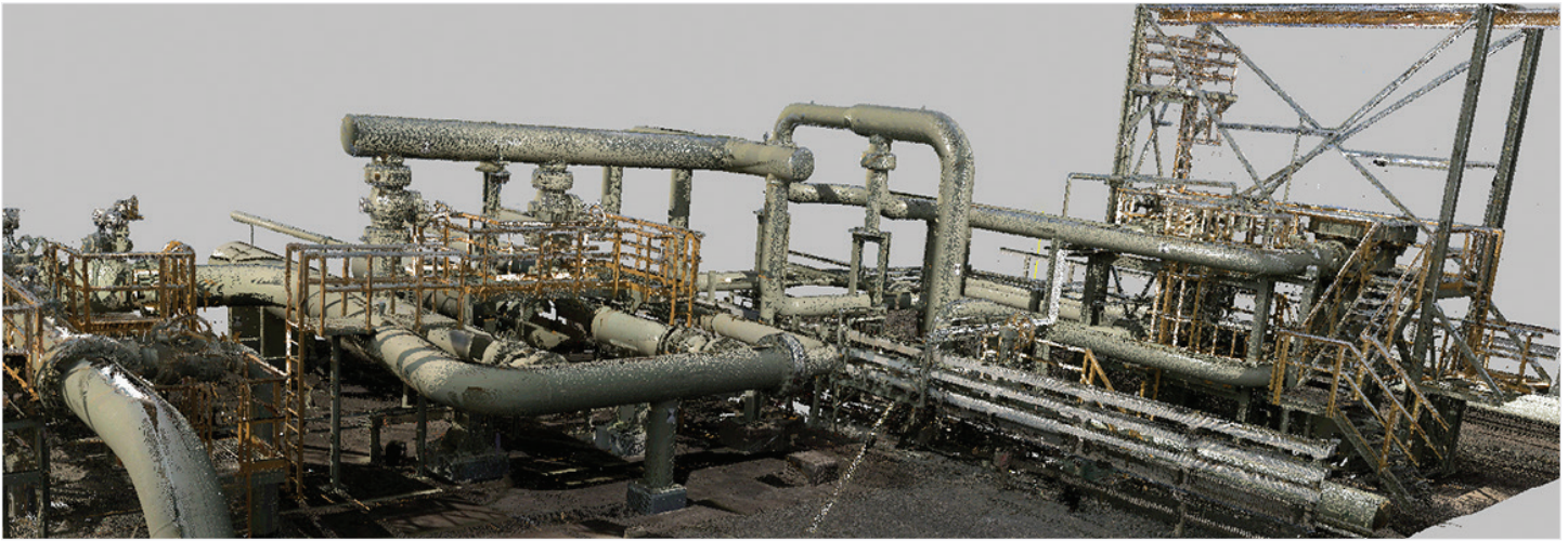
Solid point cloud visualization technology gives you a clear view of massive datasets