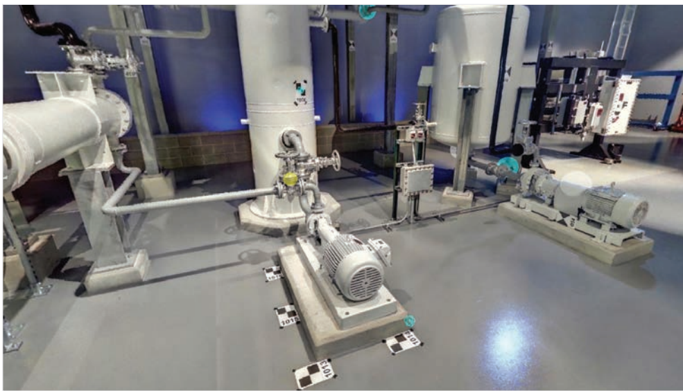
The Viewer functionality provides a window into your point cloud data. The BubbleView gives you like a bird's-eye view in which 3D data can be measured and intelligence added to it.