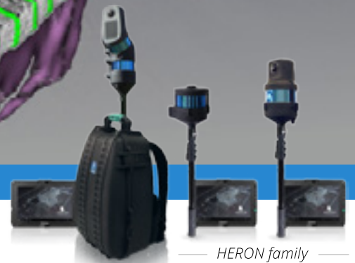
— HERON family —