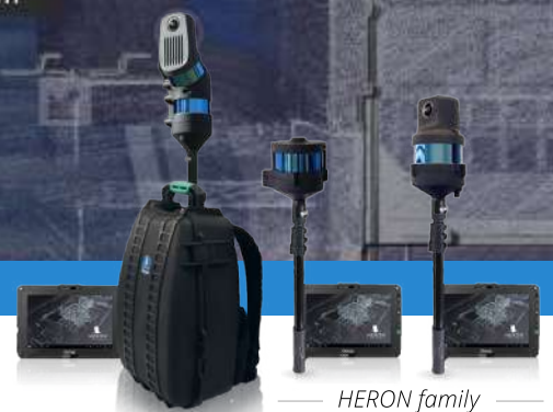
— HERON family —