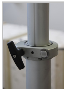
Antirotation pneumatic pole