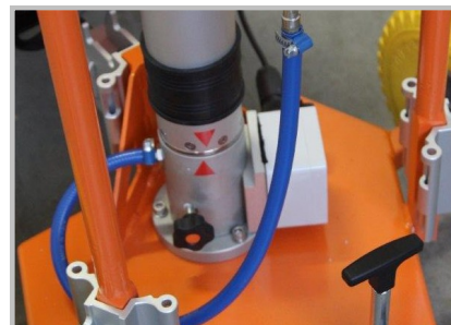
Rotating pole with blocking system